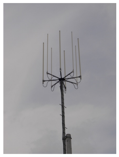
A Smart Antenna used at a PHS base station

A smart antenna is a type of antenna used at the base stations of mobile telecommunication network. Unlike conventional omnidirectional antennas, it can differentiate the direction of the mobile handset from which it is receiving the signal and direct its transmission to a certain direction by using several antenna elements. Therefore, the antenna makes it possible to reduce the transmission power of mobile handsets, and increase the number of handsets which a single base station covers (Yomogida and Shindo 2002; Siemens 2004). Smart antenna is not a proprietary technology of TD-SCDMA. In fact, it has been used in the Japanese PHS (personal handy-phone system) network since 1998 (Tahara 2003). And because PHS technology was adopted by China's fixed telephone operators, China Telecom and China Netcom, as a cheap alternative to mobile phones and branded as " Xiaolingtong ," smart antennas have already been widely deployed at the base stations of Xiaolingtong network.